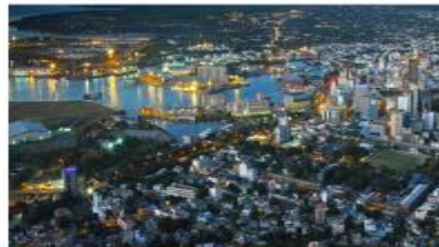
Fig. 3 Presentation on Mauritius and globalization