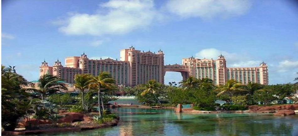
Fig. 2 Presentation on the the financial crisis and the Bahamas