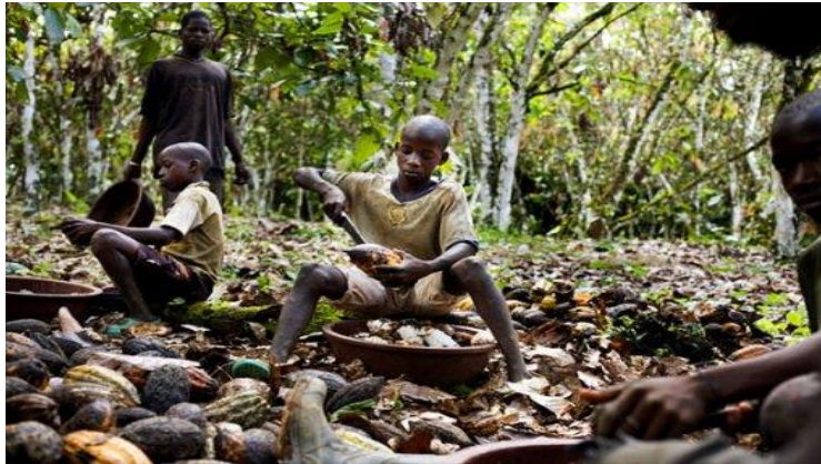
Fig. 5 Presentation on cocoa production in the Ivory Coast

Child labour and cocoa – despite official working age of 18, much farming work carried out by children in order to cover a minimum standard of living. Some are enslaved by overseers who beat them if they try to escape. Many come from Mali.