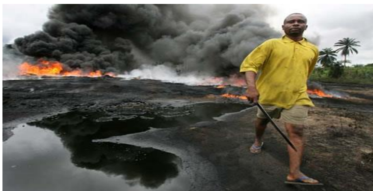
Fig. 4 Presentation on the oil industry in Nigeria

UNEP Environmental Assessment, Ogoniland 2011